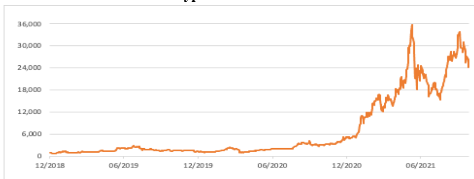
Performance (03/12/2018 - 30/09/2021) ixCrypto Ethereum Index

Data has been rebased at 1,000. All information for the index prior to its launch date is back-tested, back-tested performance reflects hypothetical historical performance.